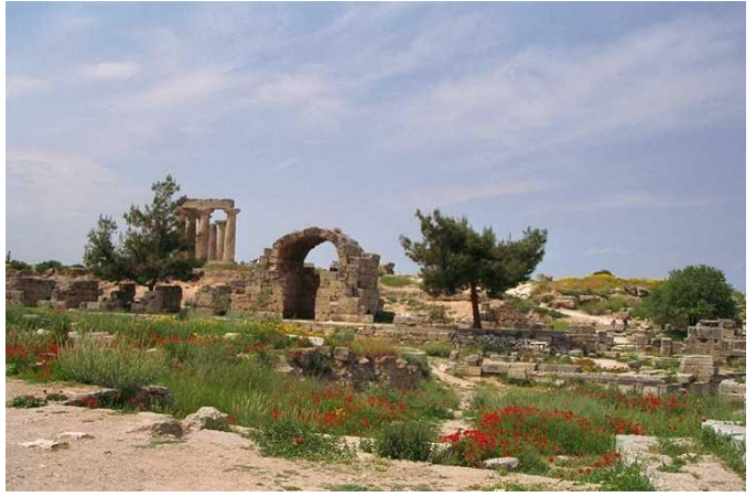
Photograph of Israel - Photo Taken Looking South